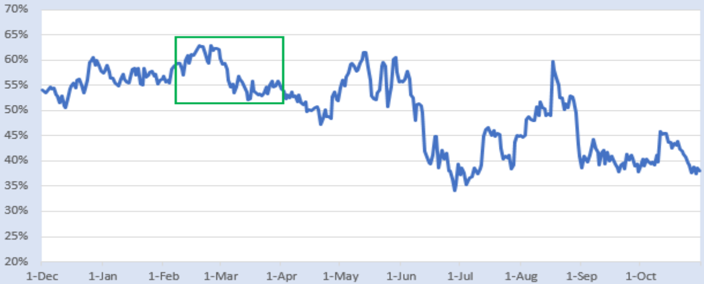
Nov Soybean Futures Avg % of Annual Range Last 10 Years